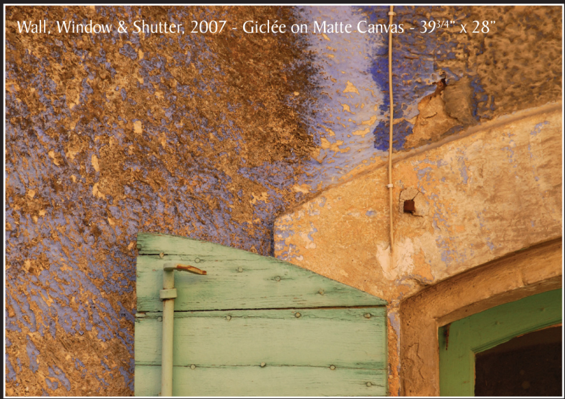
Wall, Window & Shutter, 2007 - Giclée on Matte Canvas - 39 3/4" x 28"